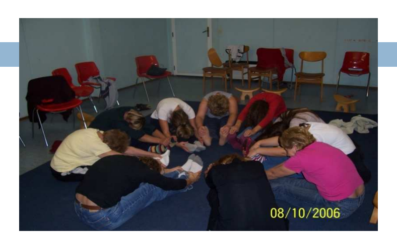
(5) mental Exercise