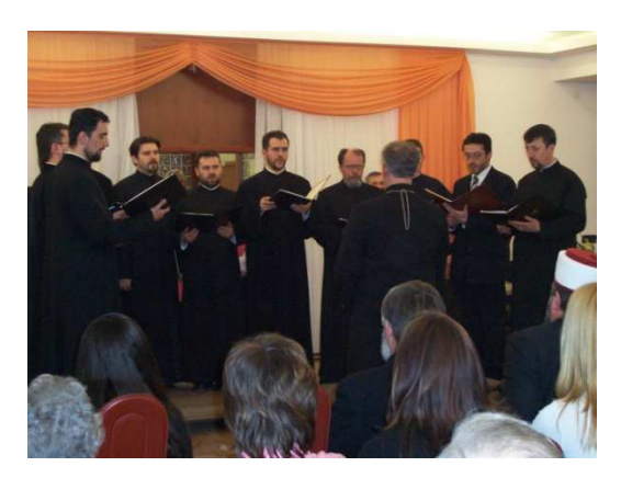
Singer Choir of the Serbian Orthodox Church