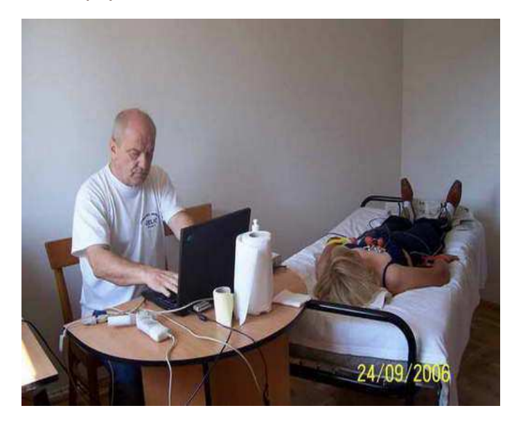
(1) medical examinations