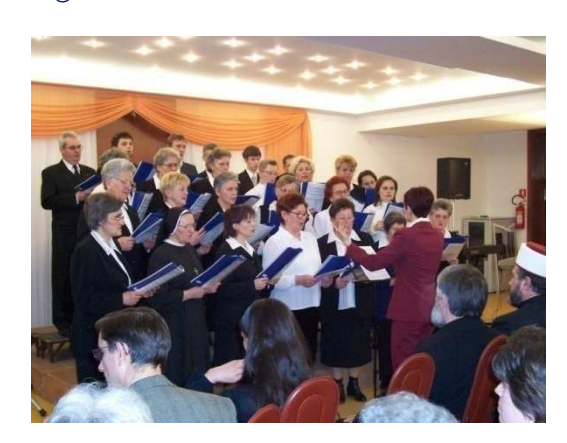
Singer Choir Roman Catholic Church